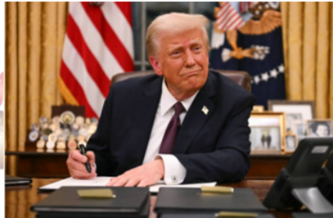
Image: TOPSHOT - US President Donald Trump signs executive orders in the Oval Office of the White House in Washington, DC, on January 20, 2025.

Fast forward to 2020 when the flame for action against discrimination was reignited, and people started paying more attention to workplace equality and the DEI.