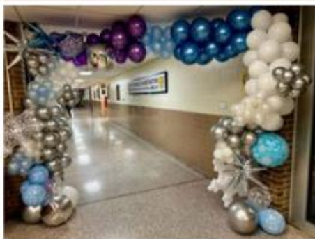
Caption: Banner (top) and festive balloon arch (bottom) welcome students to the Snowball.